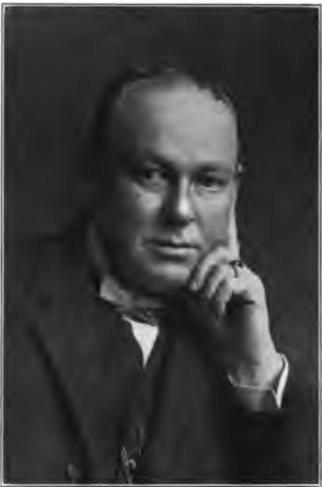
LE COMPTE DAVIS